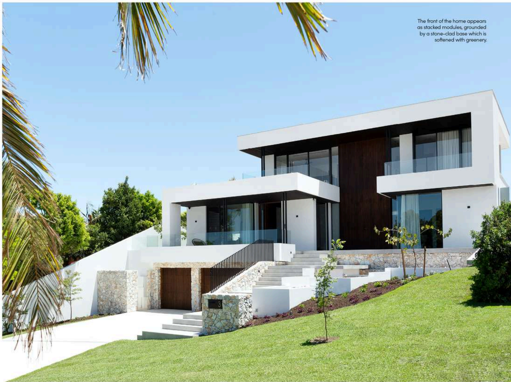
The front of the home appears as stacked modules, grounded by a stone-clad base which is softened with greenery.

For a home with it all, its generous spaces and clever design still allow it to feel warm and intimate. “It is a home for all seasons,” agrees the designer. “It’s sophisticated and adaptable and has everything they could ever need for entertaining – but most importantly, it’s for family.” ■